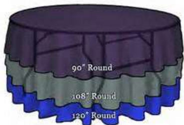
60" Round Table