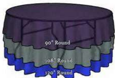
60" Round Table